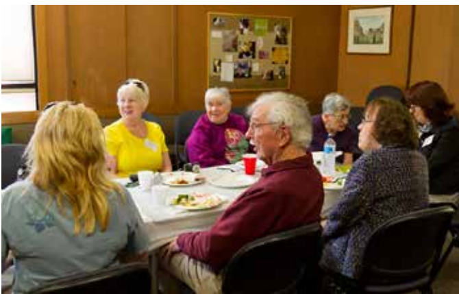
Lively conversations over delicious food.