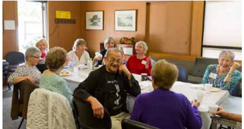
Guild members enjoying each other's company.