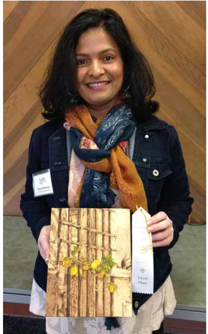
Third Place • Smruti Kurse Lemons in Window, Pyrography