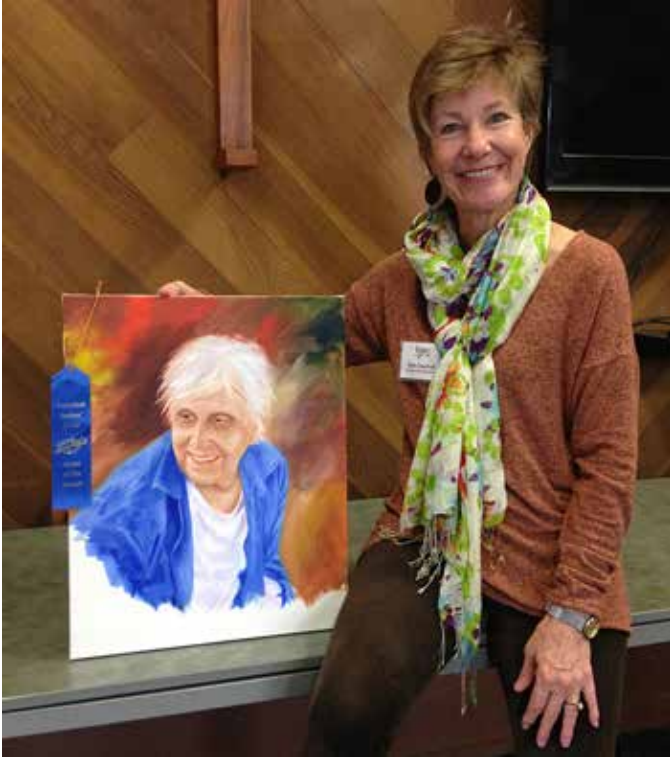
First Place • Barb Overholt Alice, Oil