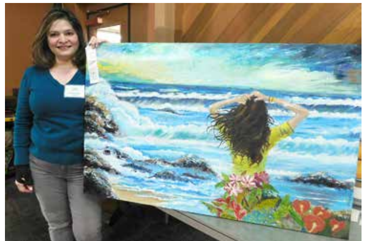
Third Place • Smruti Kurse "Hawai'ian Beach" • Oil