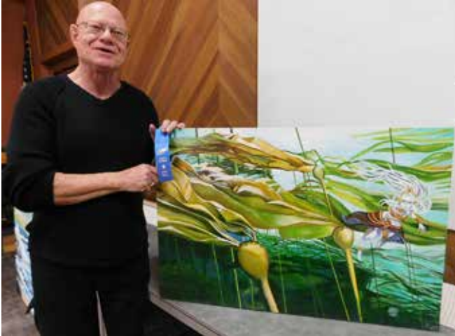
First Place • Denis Wik "Sea Witch" • Acrylic