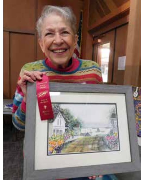
Second Place • Jackie Bishop "By the Bay" • Watercolor