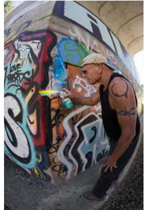
"Move over Banksy, there's a new artist in town!"