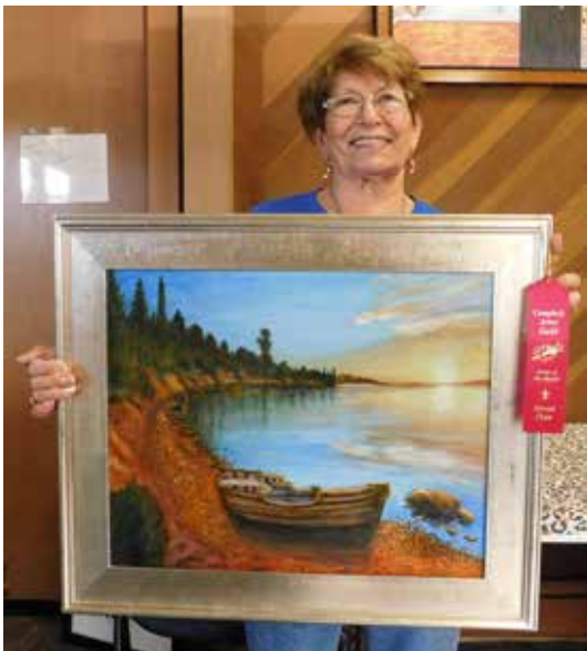
Artist of the Month Second Place • Liyuza Eisbach "Old Boat" • Acrylic