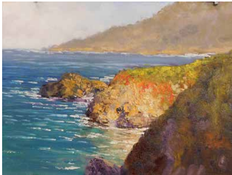
The finished product of Donald's demonstration.

He uses no additional mediums other than turpentine painting from lean to fat. Using a variety of Gamblin® colors, he prefers not to mix thoroughly; instead he allows some of the paint used in an area to stay on his brush as he works.