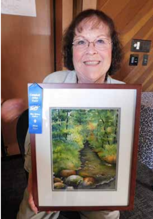
First Place • Marlene Bird "Quiet Stream" • Watercolor