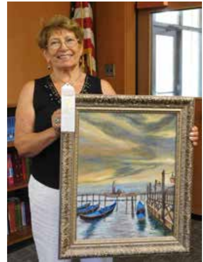
Third Place • Liyuza Eisbach "Venice at Dusk" • Acrylic