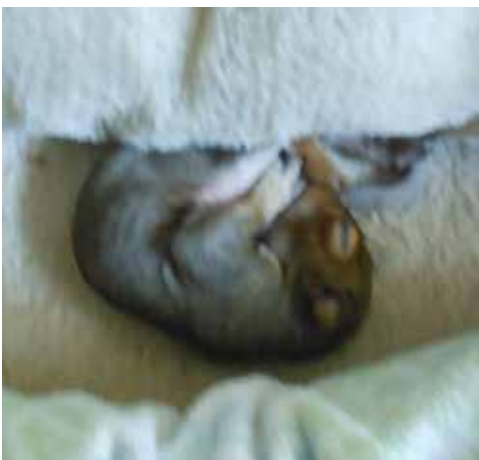
"Fred" the baby squirrel nestled in towels.