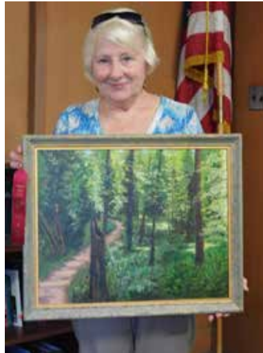
Second Place • Cathy Down "Walk in the Forest" • Oil