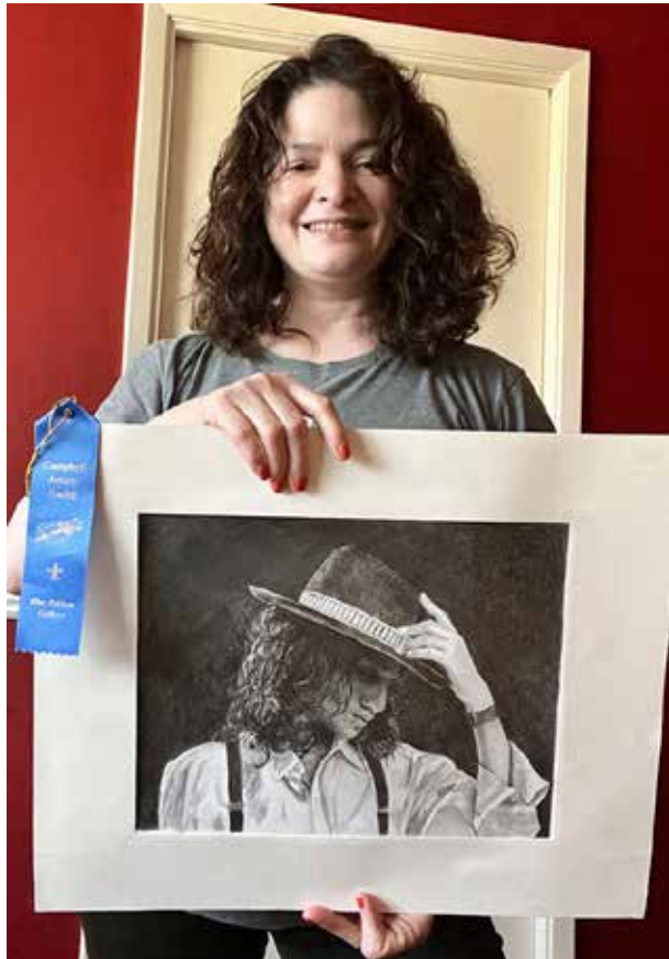
Smruti Kurse Rhuta • Graphite