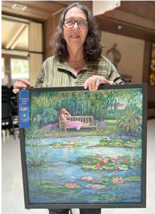
Jude Tolley Huntington Gardens • Oil