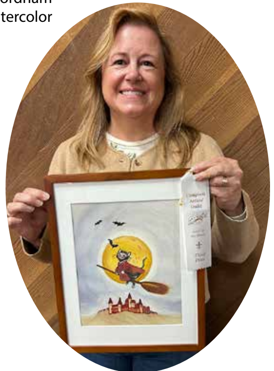
Third Place • Raychelle Fordham Happy Halloween • Watercolor