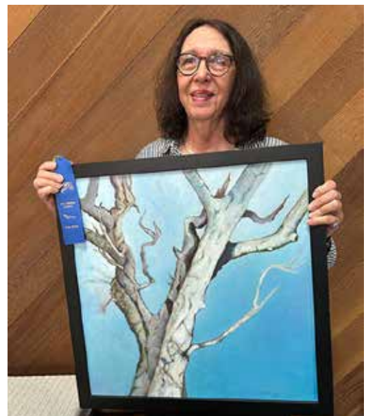
Jude Tolley The Young Slowly Eclipses the Old • Oil