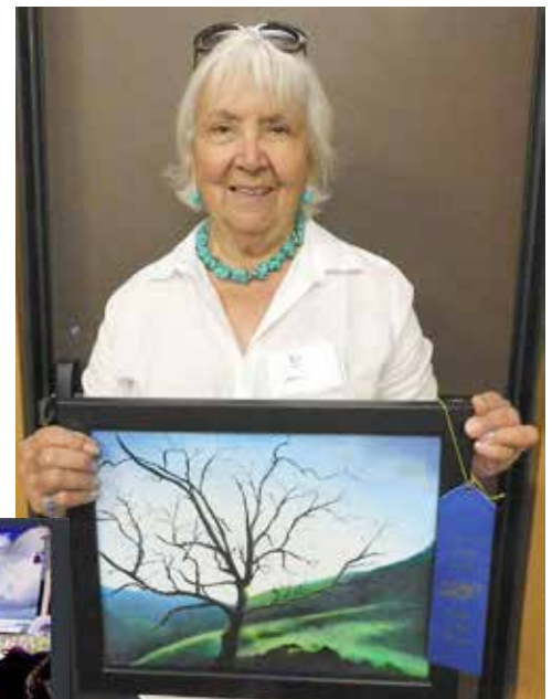
First Place • July 2016 Fall • Oil