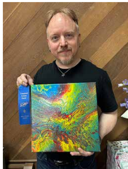
Elton Glover Open the Bifrost • Acrylic