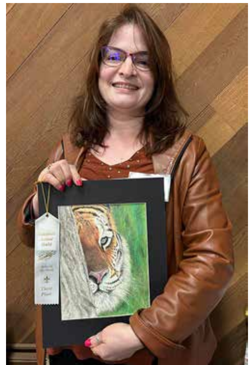
Third Place • Smruti Kurse Jungle Reckoning • Colored Pencil