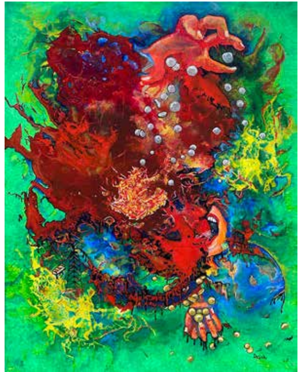
Grasping – The Second Noble Truth