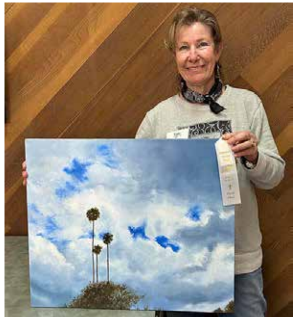
Third Place • Barb Overholt Good Neighbors • Oil