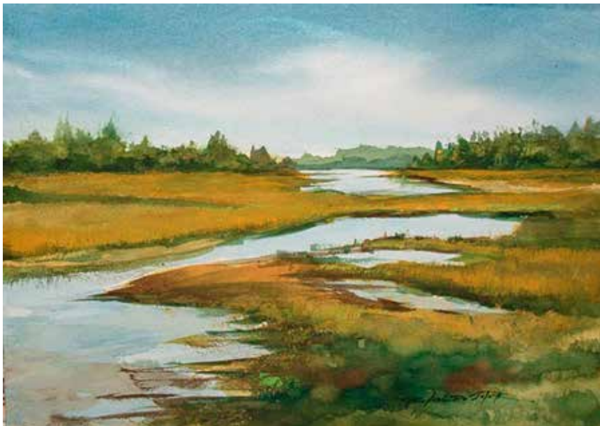
Final demonstration in watercolor.

Visit his website: rafaeldesotojr.com to see more of his amazing works.