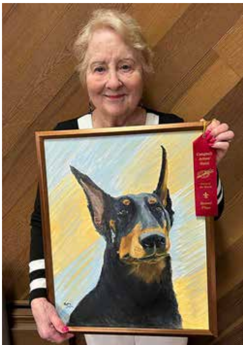
Second Place • Cathy Down Big Rotty • Oil