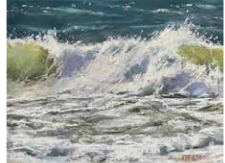
King Wave Arrives at Shore