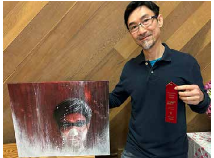
Second Place • Steven Tu The Disappearing Thought of a Starry Night Acrylic