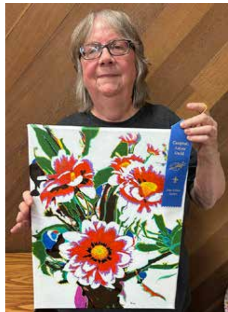
Diann Klink Fade to White • Acrylic