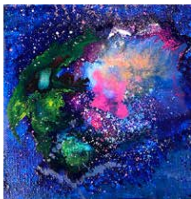
11x14 Demonstration Canvas