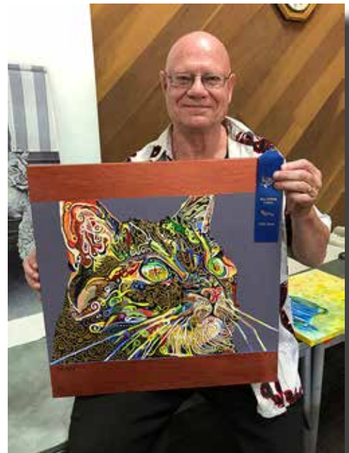
Denis Wik "Prescription Kitty" • Acrylic