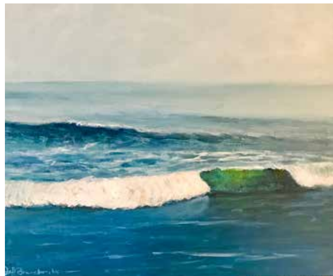
Jeff's seascape demo • FINAL.