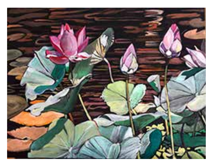
Linda's completed painting.