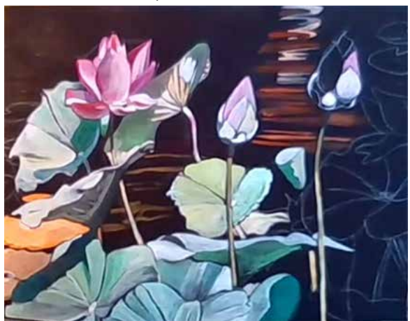
Working down to the left and painting the leaf and the blossom's shadow.