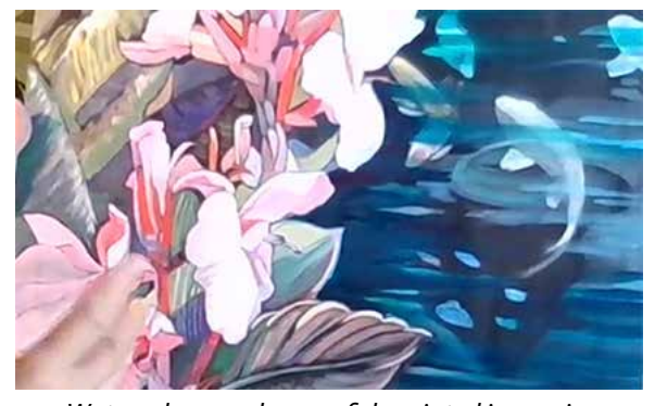
Watercolors used over a fish painted in casein.