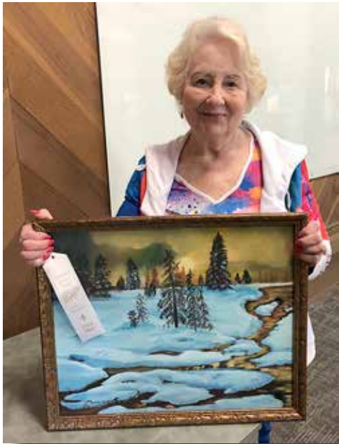
Third Place • Cathy Down Cold, Cold, Cold • Oil