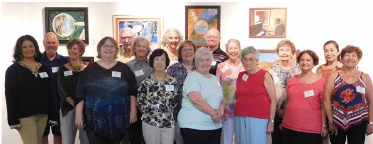
Blast from the Past – Annual Art Show Exhibitors 2017