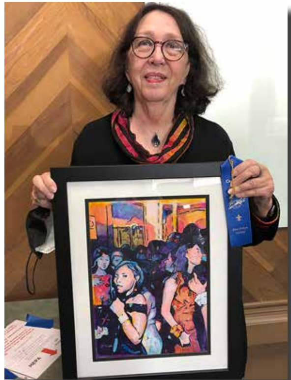
Jude Tolley Pre-pandemic Prom • Acrylic