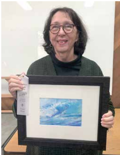
Third Place Jude Tolley "Carmel Waves" • Watercolor & Gouache