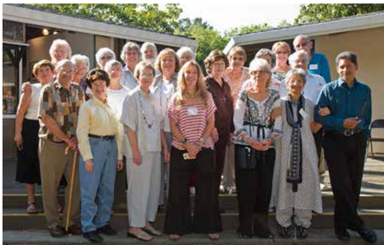
A Blast from the Past – Annual Art Show Exhibitors 2011

Opening Reception • 12:30–3:30 p.m. Saturday • August 5