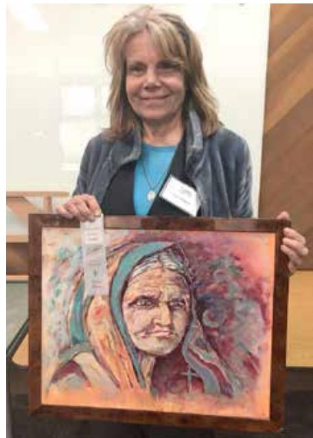
Third Place Lynn Rogers "My Ukrainian Great-grandmother" • Acrylic