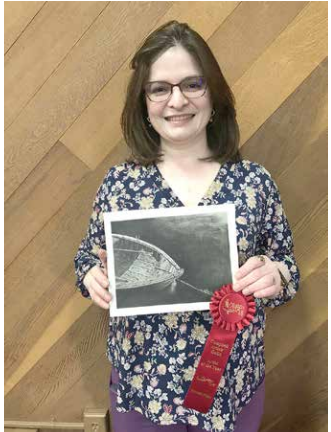
Second Place Smruti Kurse "Moored" • Charcoal