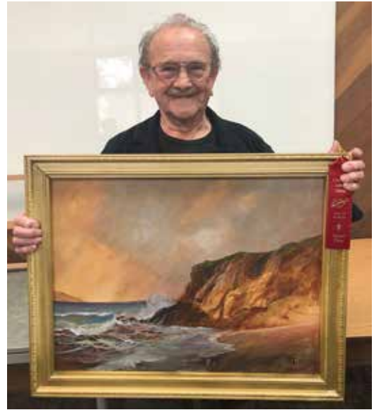
Second Place Dave Eisbach "Adventure in Tone" • Acrylic