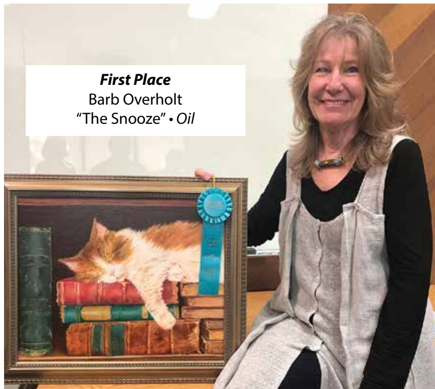
First Place Barb Overholt "The Snooze" • Oil