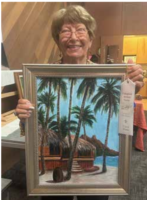
Third Place Liyuza Eisbach Thailand Cottage • Acrylic