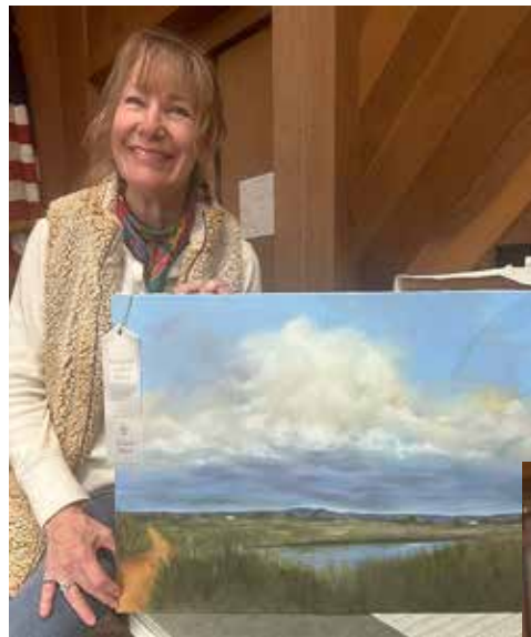
Third Place Barb Overholt There's a Storm Abrewin' • Oil