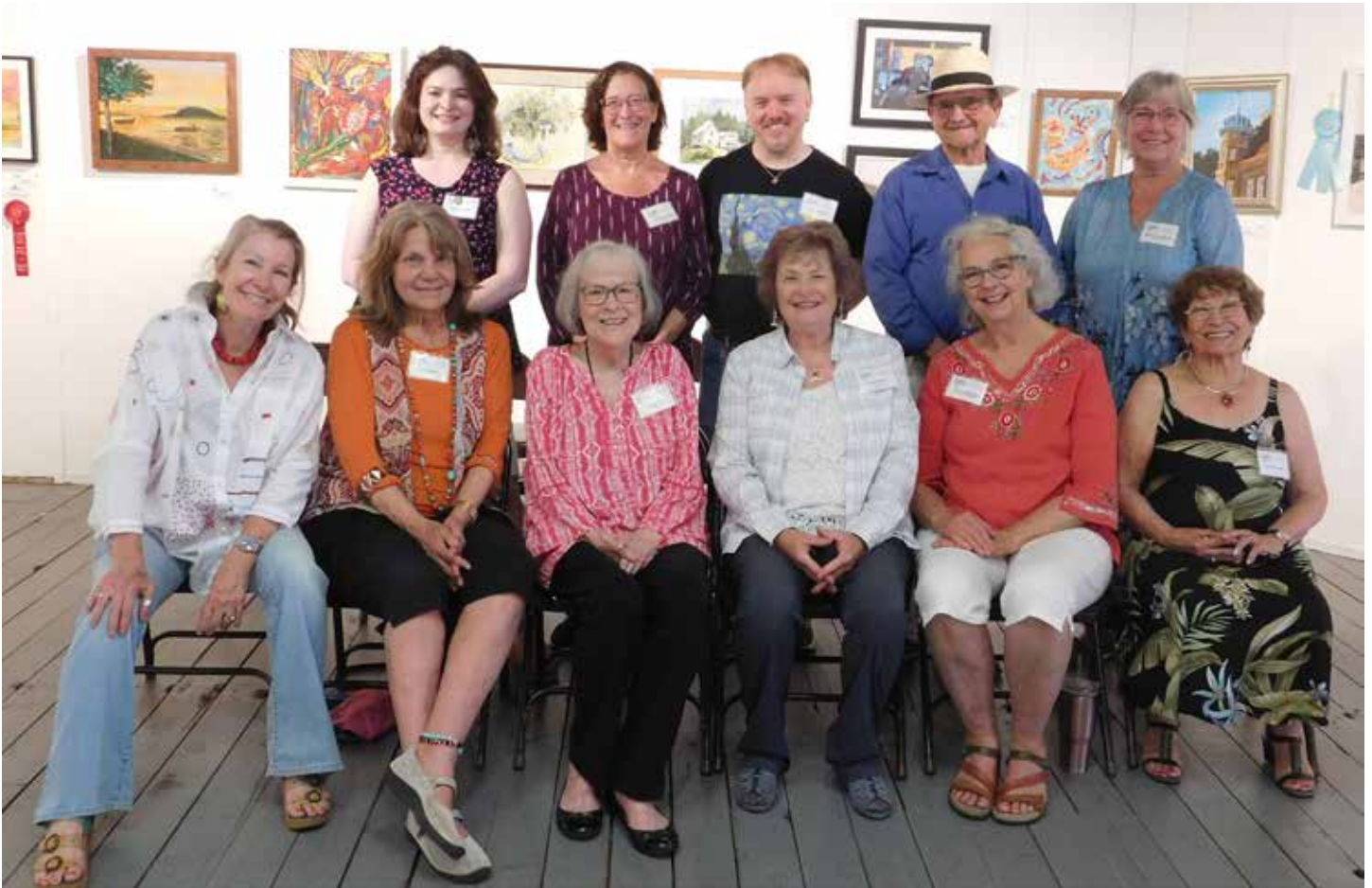
25th Annual Art Show • August 2023 Eleven of our 19 exhibitors were available for a group photo.