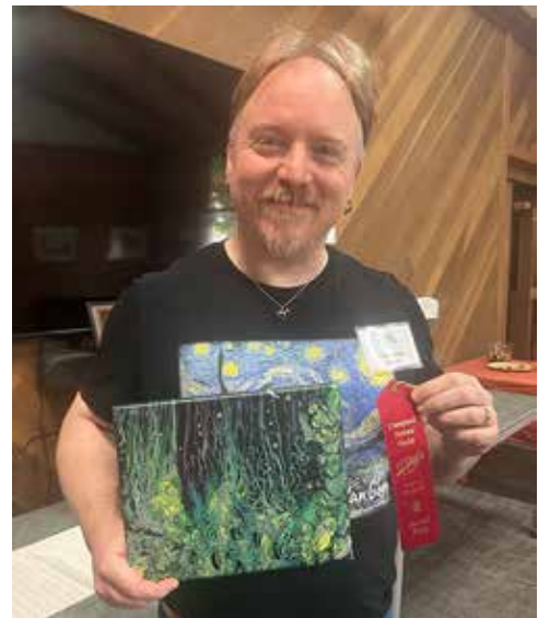
Second Place Elton Glover Iridescent Waterfall • Acrylic