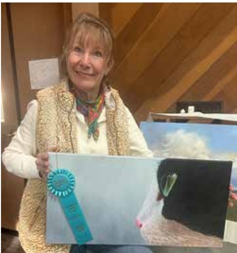
First Place Barb Overholt Through a Looking Glass • Oil