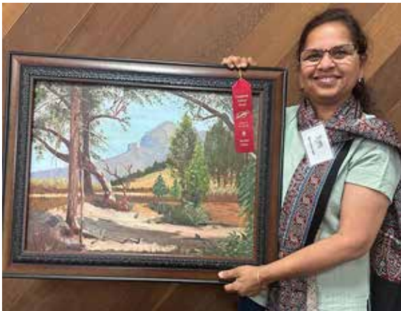
Second Place • Archana Jain Shades of Pink Mountain • Oil