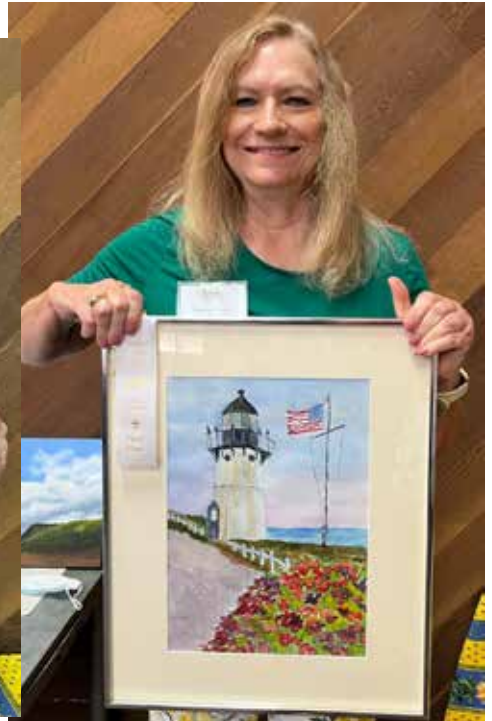
Third Place • Karen Polyak Port Clyde Lighthouse • Watercolor