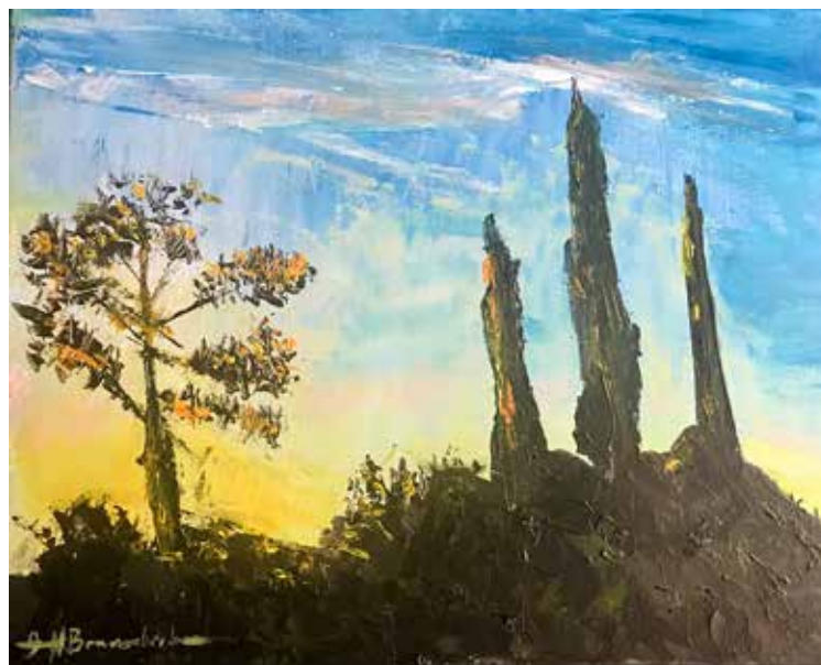
Jeff's final painting • Early Sunset with Cypress