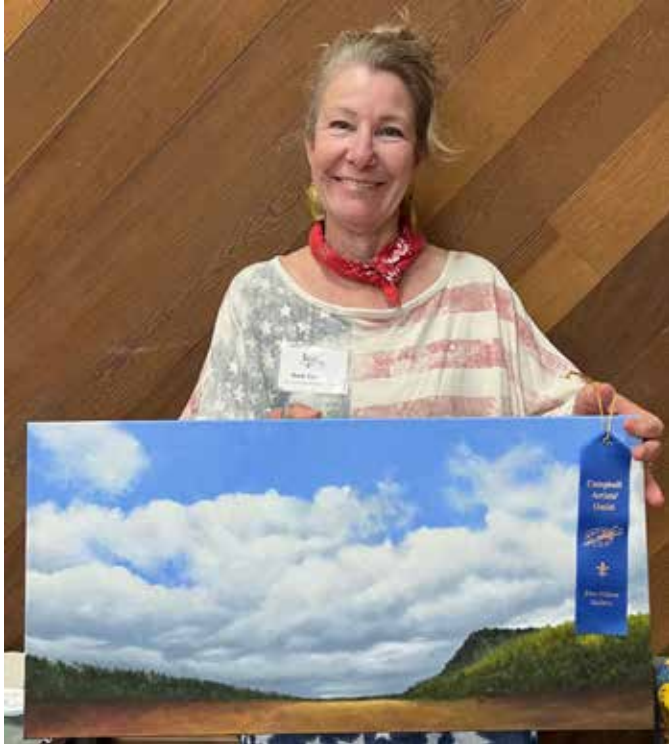
Barb Overholt Morning Light • Oil