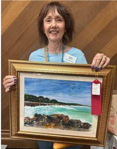
Second Place • Patricia Heeny Miramar Beach Escape • Watercolor