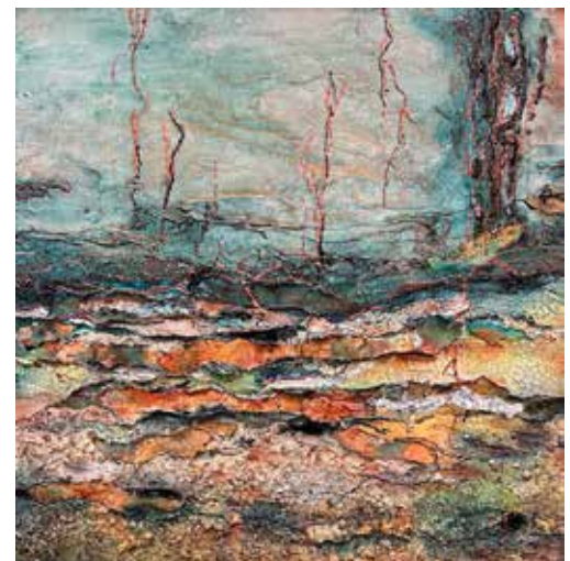
One of many of Daniela's paintings on display.