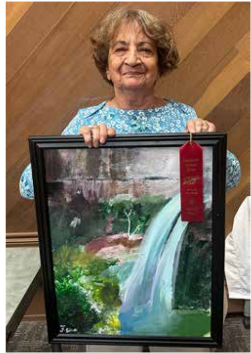
Second Place • FAranik Sinai Waterfall • Acrylic