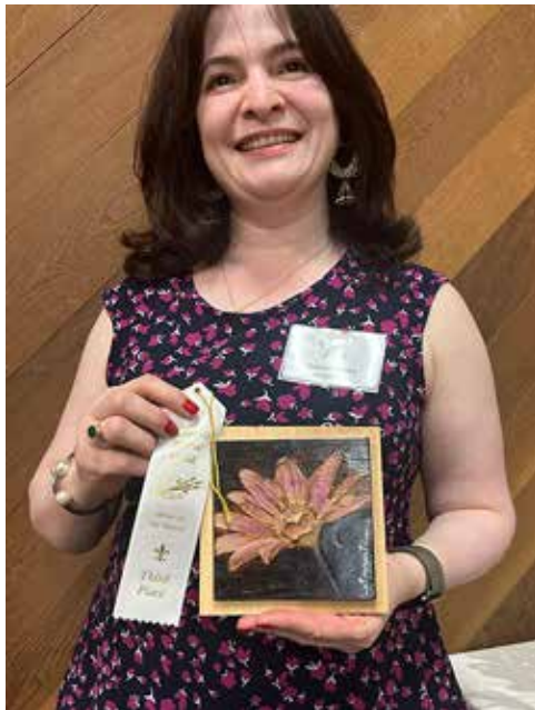
Third Place • Smruti Kurse Flower • Mixed Media