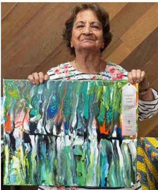
Third Place • FAranik Sinai Beauty • Acrylic