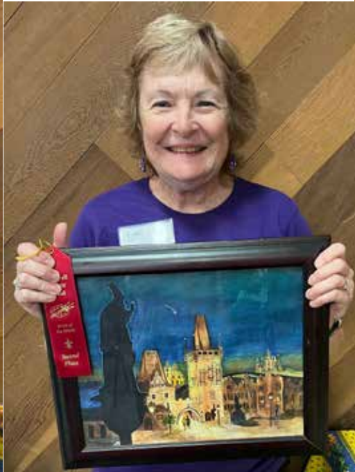
Second Place • Kris Rogers Nocturnal Prague Blessing Watercolor