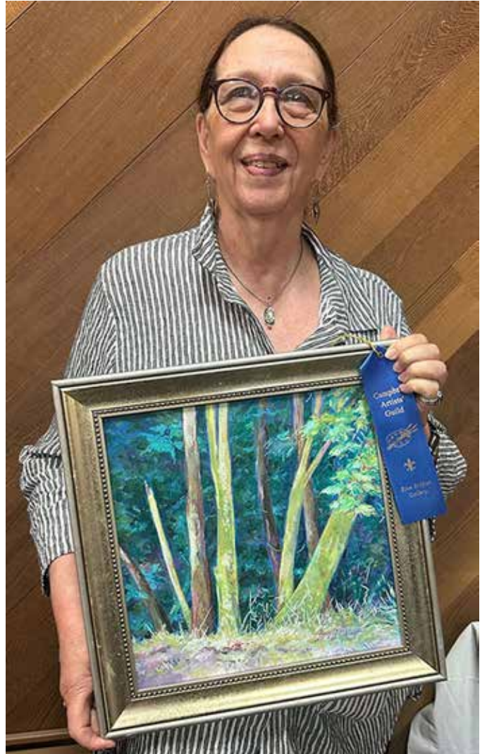
Jude Tolley Mt. Madonna Drive • Acrylic