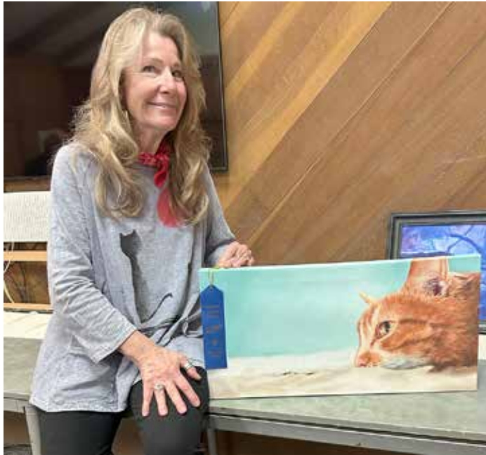
Barb Overholt The Art of Cat Contemplation • Oil