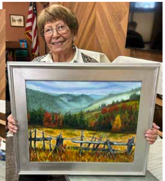
Liyuza Eisbach • Broken Fences Acrylic