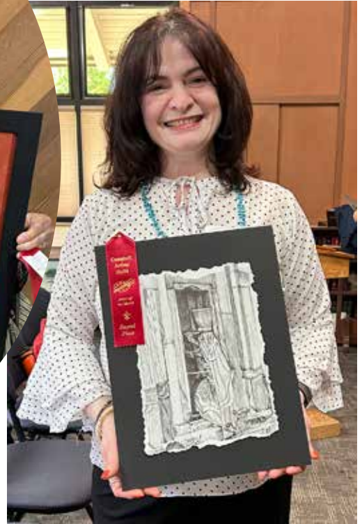
Second Place • Smruti Kurse Daily Toil • Pen and Ink