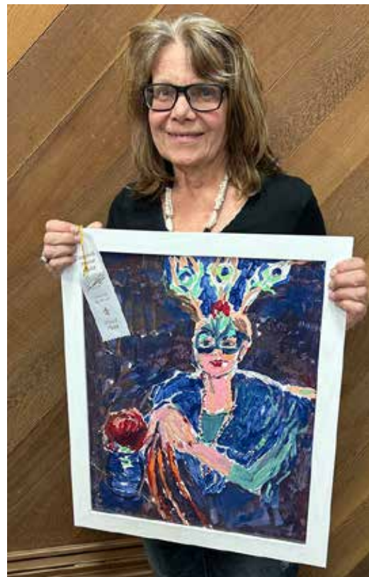
Third Place • Lynn Rogers Masquerade • Acrylic