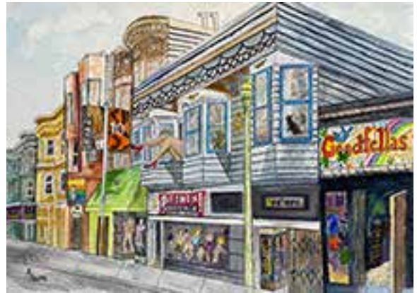
Haight Ashbury Time Capsule