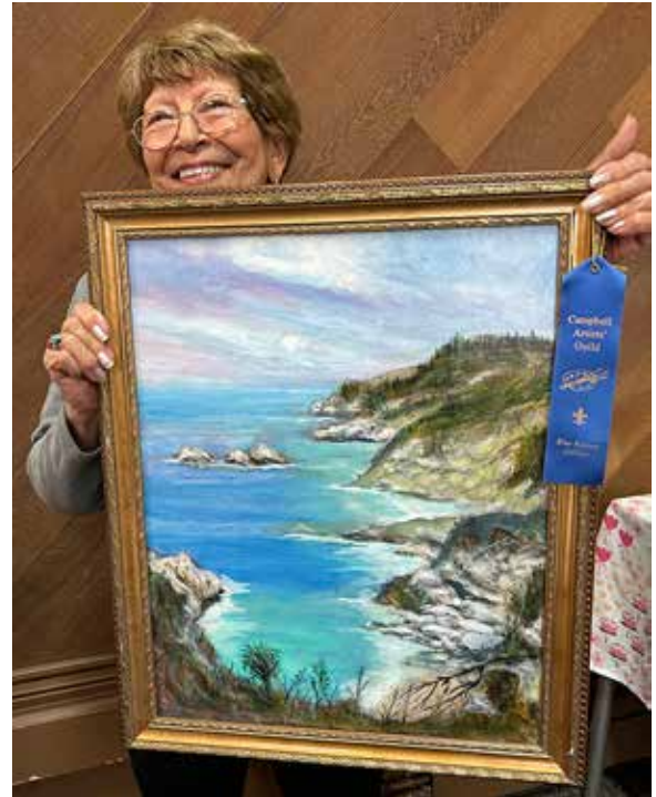
Liyuza Eisbach Big Sur • Acrylic