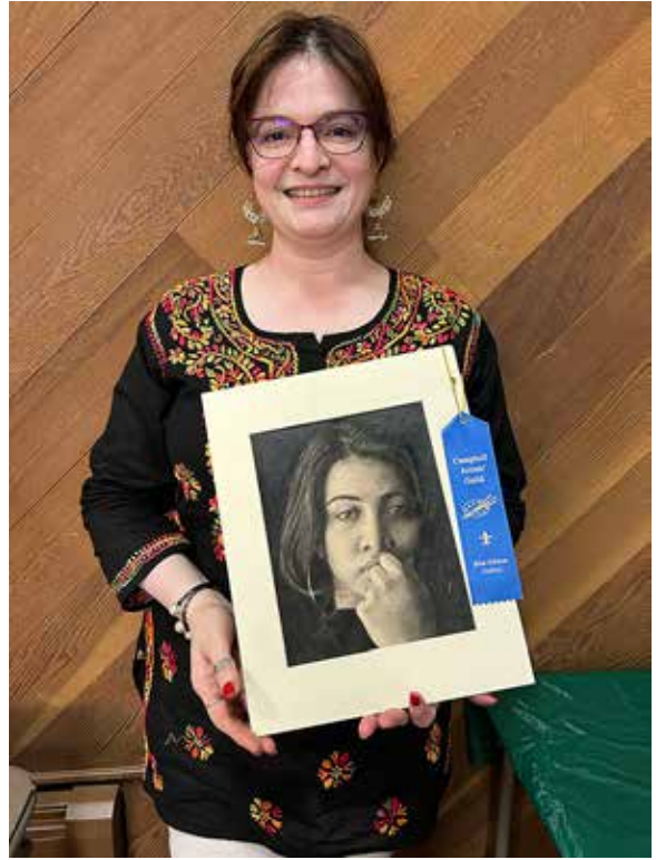
Smruti Kurse Neeya • Charcoal