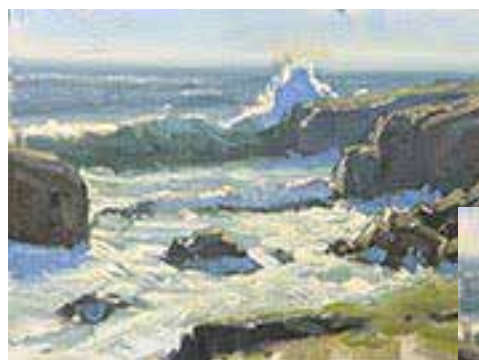
Working on sea-foam highlights.