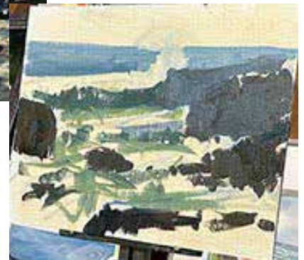
Building the scene.