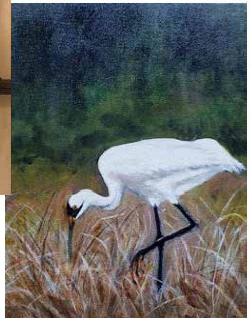
Third Place • Liyuza Eisbach Whooping Crane • Acrylic