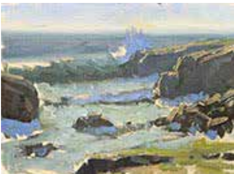
Creating rock highlights and a base for the sea-foam.