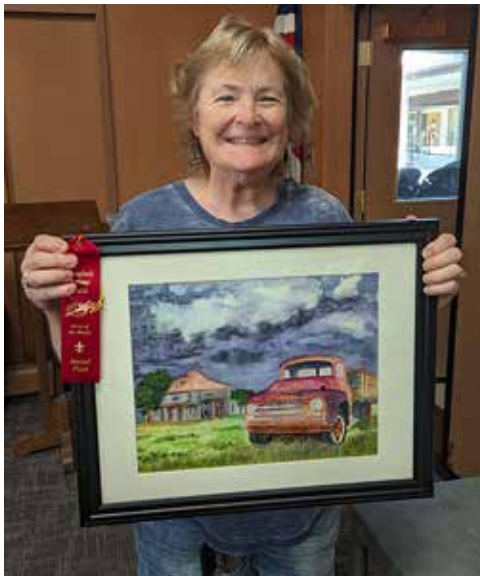
Second Place • Kris Rogers No Forwarding Address • Acrylic