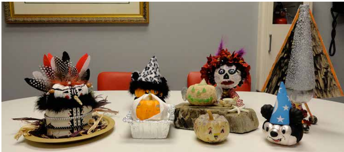
Examples of a past competition.