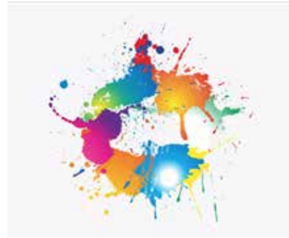
Two examples of Circle or Closed Compositions