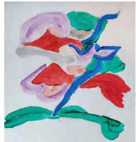
Dave Eisbach's untitled creation