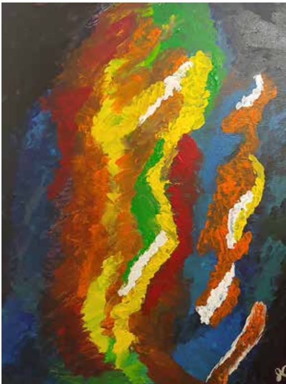
"Figure in the Flames"