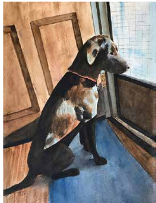
Patti Pierce’s “Curiosity”