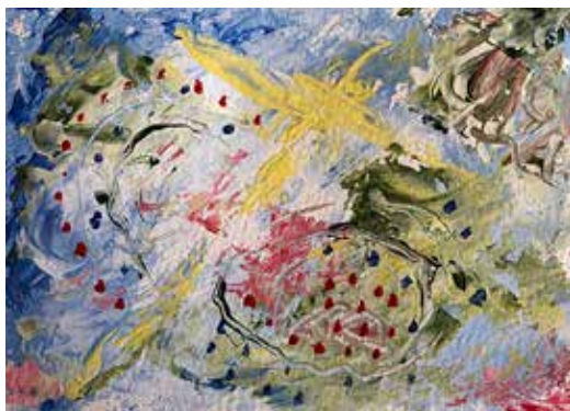
Barb Overholt's palette knife creation "Circle of Friends"