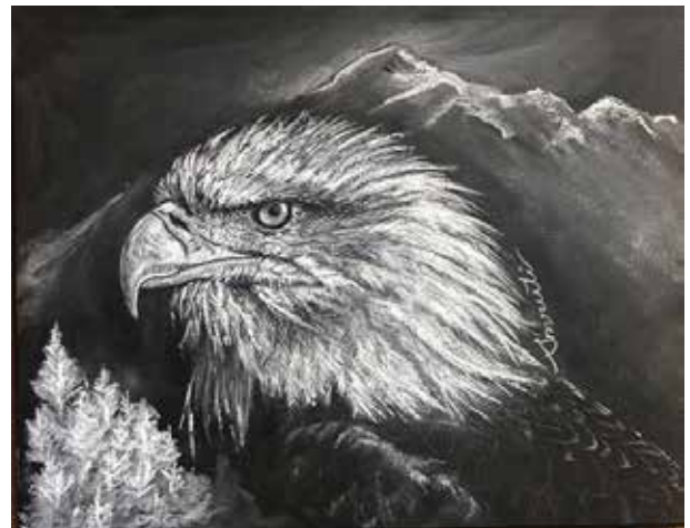
Third Place Smruti Kurse "Bald Eagle" • White Charcoal