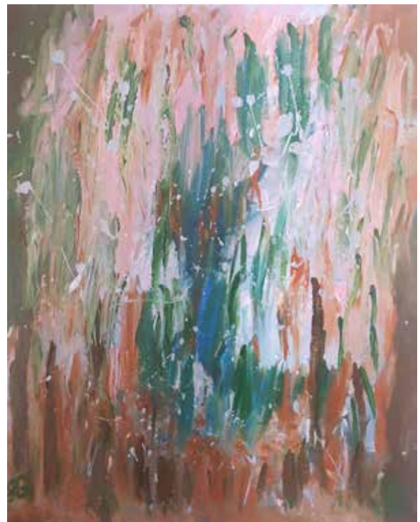
"Itla-Okla (Spanish Moss)"