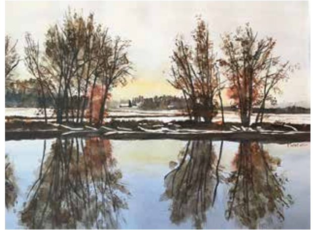
Second Place Patti Pierce "Winter Reflections" • Watercolor