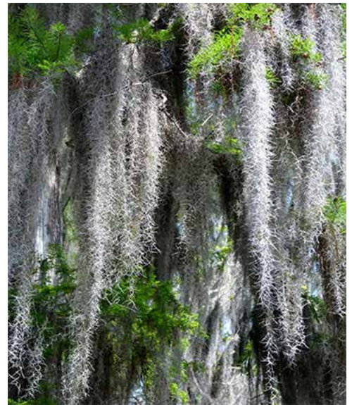
Photo of Spanish Moss