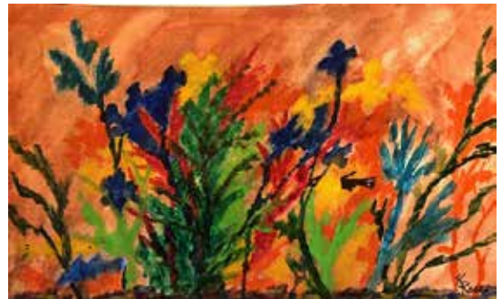
Kris Rogers' two abstracts (above) "Island Vibe" (top) and "Fish Tank"