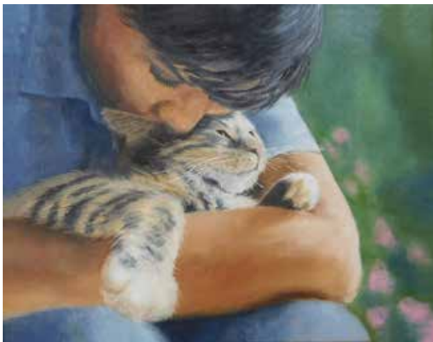
Barb Overholt "Love at First Sight" • Oil