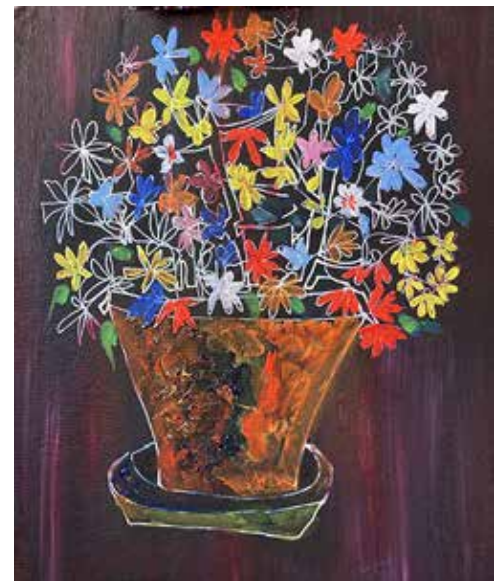
Bottom Right: Smruti's Flowers