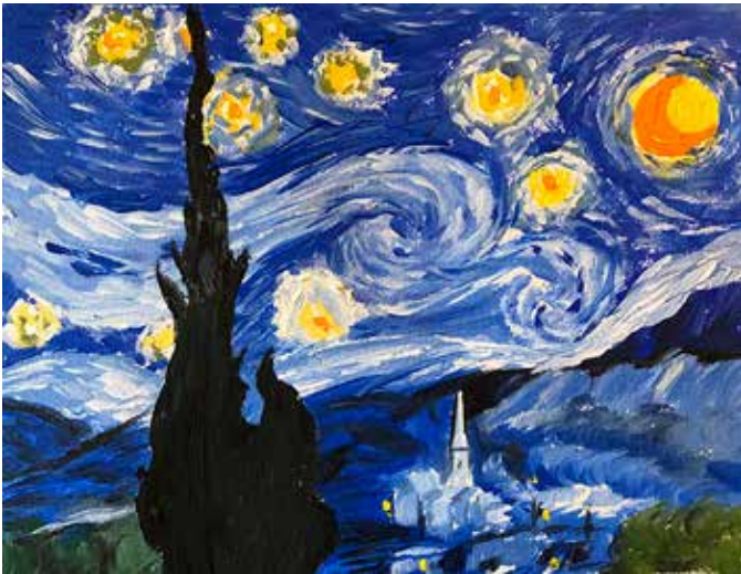
Barb Overholt's interpretation