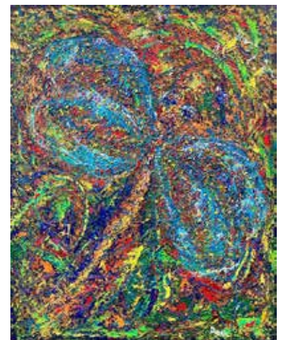
Third Place Diann Klink "Dragonfly" • Acrylic