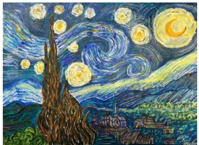
Kris Rogers' interpretation