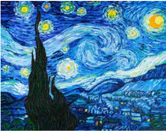
Vincent van Gogh's "Starry Night"