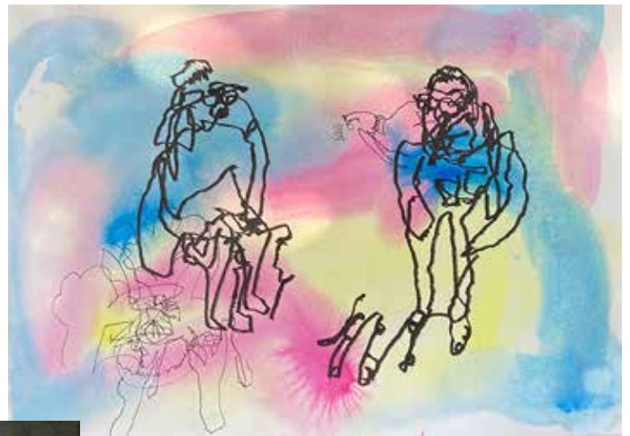
Top Right