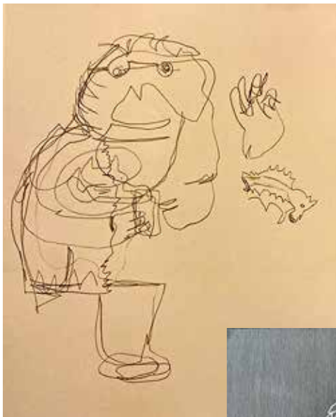
Top Left