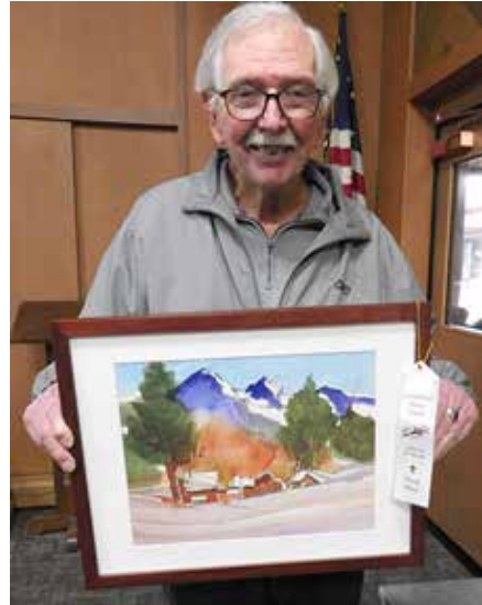
Third Place Al Girauda "Winter" • Watercolor