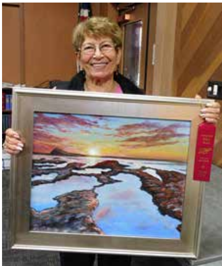
Second Place Liyuza Eisbach "Seascape" • Acrylic