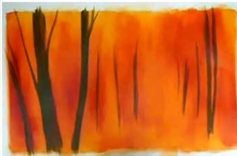
(B) Position of Trees