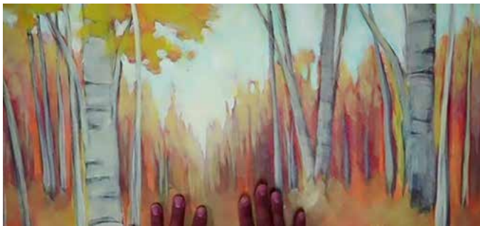
Example of "having an out."

Jaya toned her canvas (A) in the colors that would be her background varying their saturation levels. Using a pencil, she created reference points for the Aspens and proceeded to paint in their positions (B) from mixing Quinacridone Gold and Black. Adding the sky was next (C) using Cerulean Blue Deep and Aureolin Hue; adding negative space, trees in the background, and the bark – keeping the bark pattern random; and adding foreground grass with a mixture of Aureolin Hue and Black (D). Her demo painting was not completed.