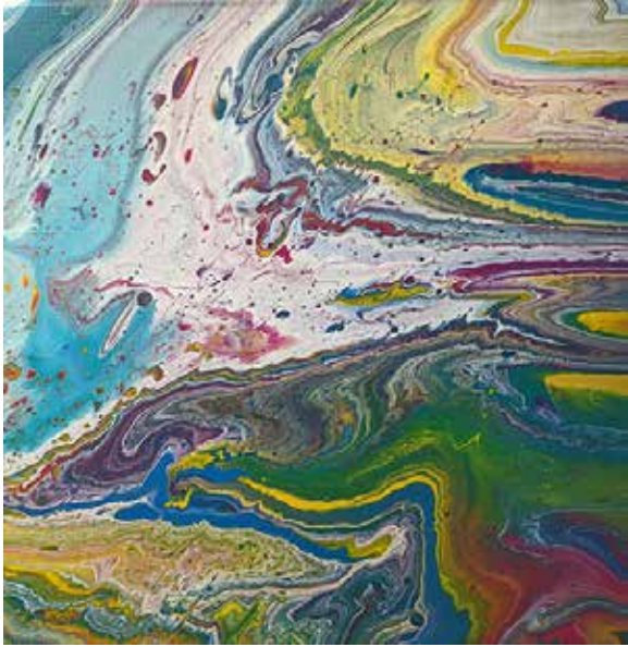
Third Place Elton Glover "Hot Spring" • Acrylics