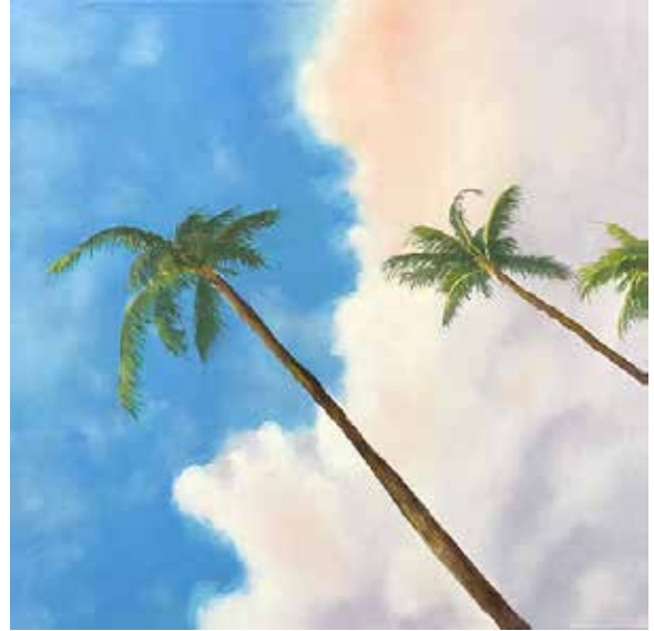
Third Place Barb Overholt "Three Amigos" • Oil