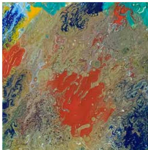
Pours by Faranik Sinai