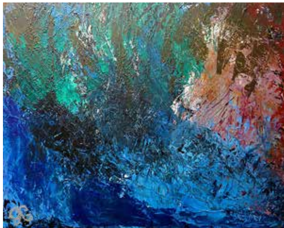
"Chamber of Secrets"