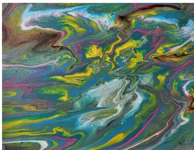
Figure 6 • “Global Warming”