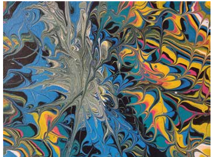
Figure 5 • "Wyld Flowers"