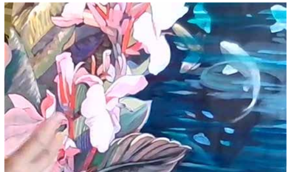
Watercolors used over a fish painted in casein.