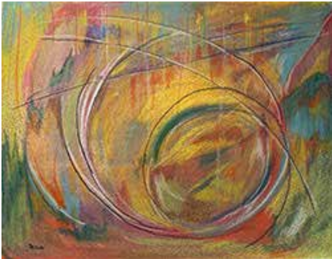
"Wind and Rain"