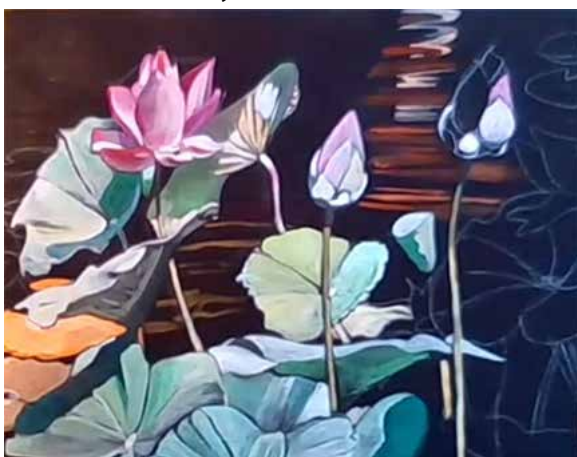
Working down to the left and painting the leaf and the blossom's shadow.