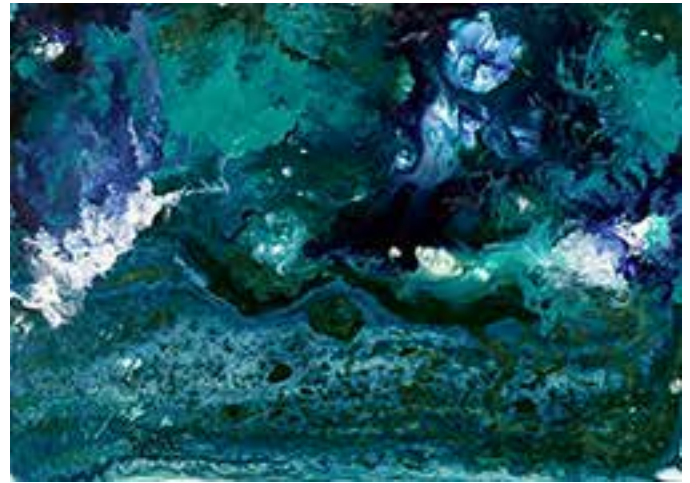
"Wade in the Water"