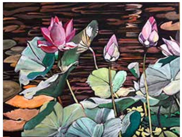
Linda's completed painting.