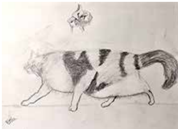
Jennifer Glover kept busy with a plethora of sketches too numerous to show here that included "Jasmine" (top) and a lovely floral bouquet (right).