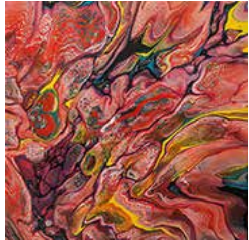
First Place Elton Glover "Pink Rose" • Acrylics