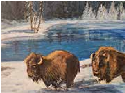
Second Place Liyuza Eisbach "Buffalo" • Acrylics