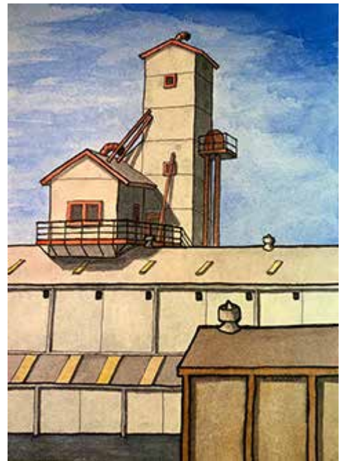
Third Place Rob Kambak "Grain Elevator 2" • Watercolor/Ink