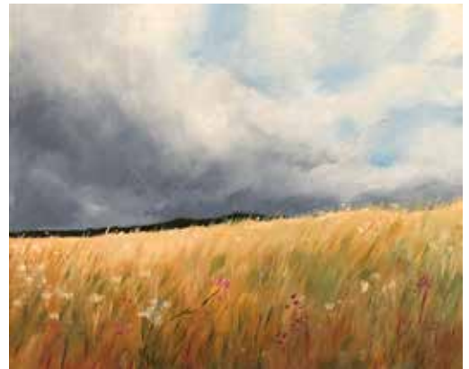
Barb Overholt • Having been away from using acrylics for years, shared a recent inspiration of a French landscape created in acrylics.