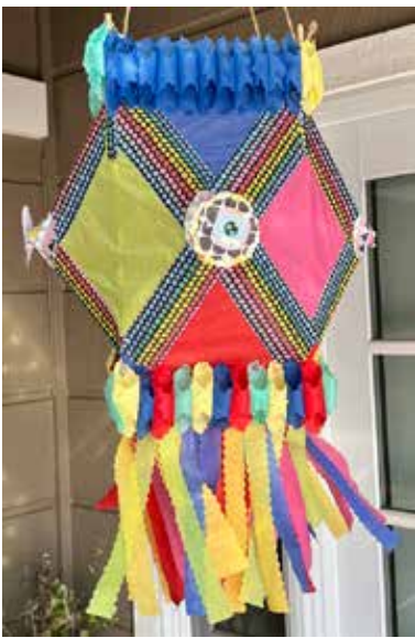
Smruti Kurse created a lantern that illuminates outside of her studio.