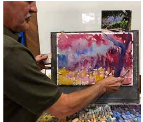
Covering the entire surface using watercolors in complimentary colors that will enhance the final application of pastels.

We hope he will return in the near future for another opportunity to demonstrate his many talents. In the meantime, you may visit his website and view his beautiful paintings at: www.spearsonartist.com .