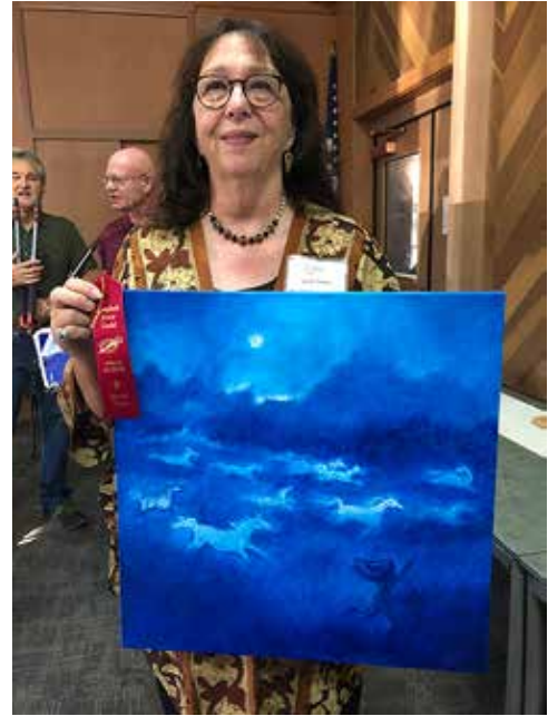
Second Place • Jude Tolley "The Girl Who Ran with the Ghost Horses" Acrylic