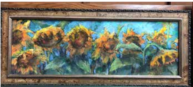
One of three finished art pieces shared by Sam.