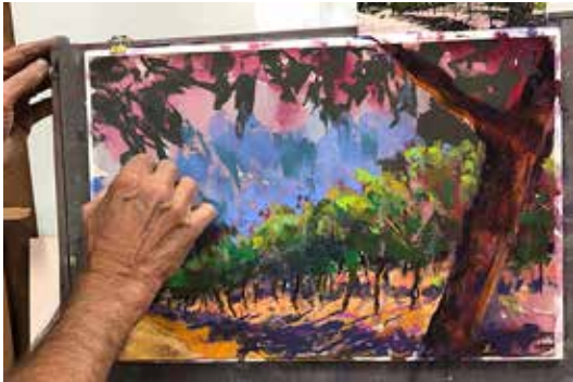
Applying hard and soft pastels.