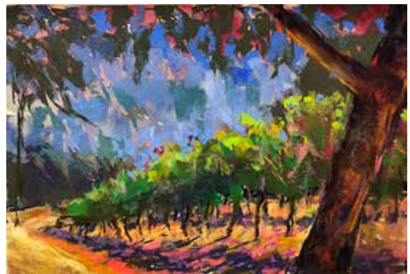
The finished product.